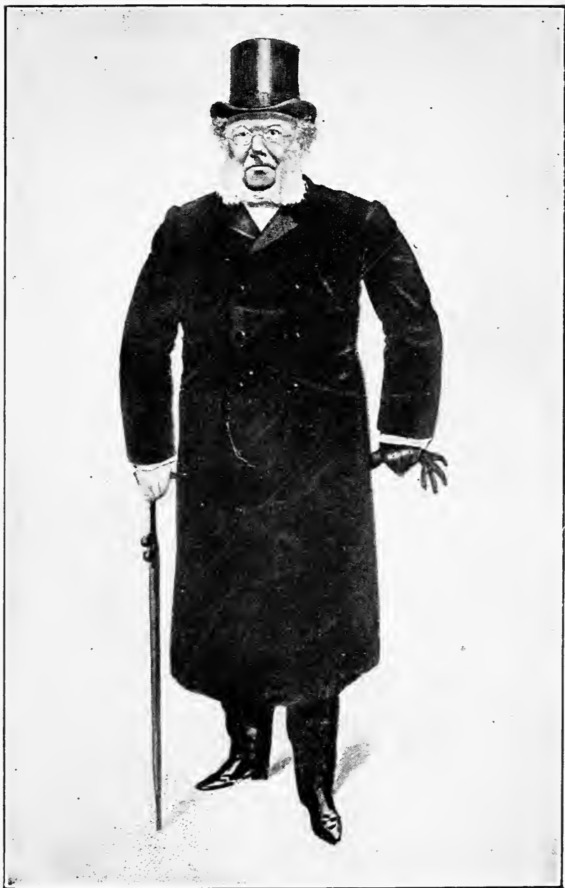
From a drawing by Gustav Laerum.